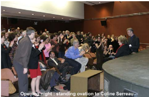
Opening night : standing ovation to Coline Serreau